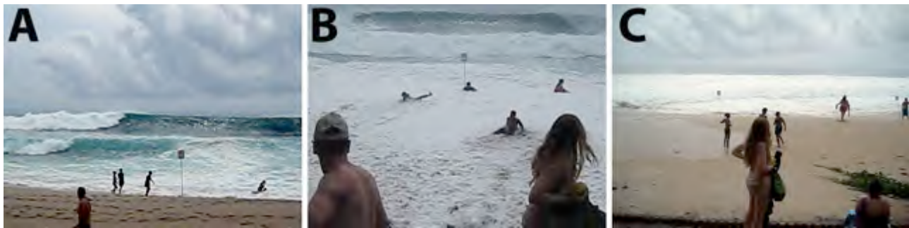
Figure 3. Video footage extracts of the March 20 th , 2010 wave train observed at Boucan-Canot. A: arrival of the wave train, B: flood, C: back to normal.