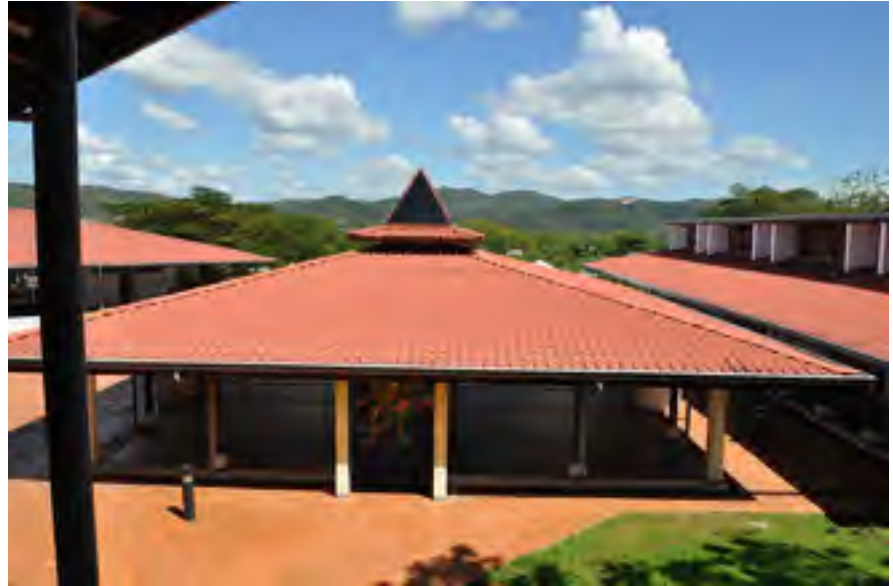
Photos of the Nicoya Campus and of the Auditorium where the 6 th International Tsunami will be held.