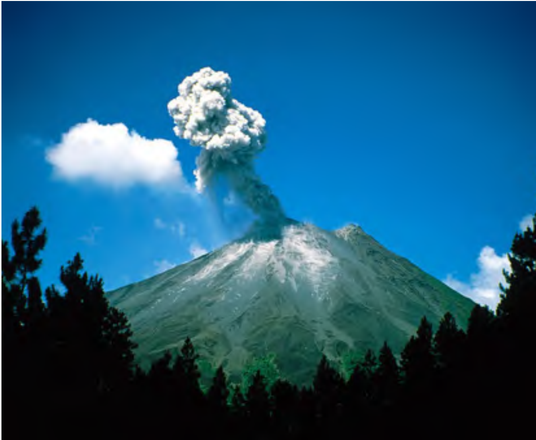
Arenal Volcano and National Park - Costa Rica http://www.arenal.net/