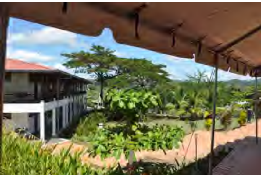
General view of the National University of Costa Rica, Nicoya campus