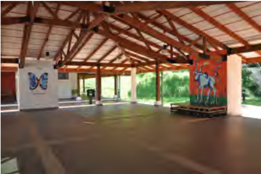
Room where coffee breaks will be set up and lunch will be served